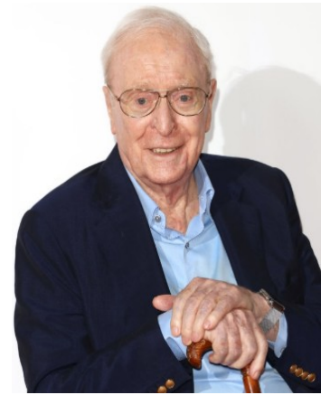
Aged 91 (2024)

During his life he has published his memoirs, written a novel, played football with Pelé and danced with Bob Fosse. He also became close friends with John Lennon, saying: "It was a case of bonding because we were both working class and we shared a sense of humour". His closest friends included Sean Connery and Roger Moore. At the 61st Academy Awards, the three of them presented the prize for Best Supporting Actor (which Caine and Connery have also won) to Kevin Kline.